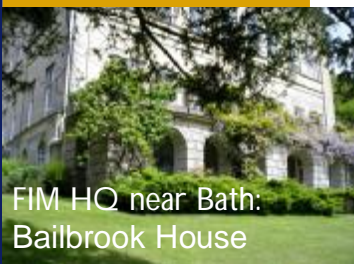
FIM HQ near Bath: Bailbrook House

"There is an urgent need for Integrated Medicine training, teaching and research. Predominantly tax based systems, such as Britain's NHS, are particularly vulnerable economically unless new approaches can be found to return people to health with simpler and cheaper holistic strategies." Professor Karol Sikora, oncologist.